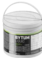
BYTUM LIQUID page 50