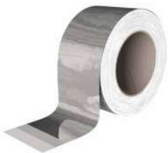
ALU BAND page 66