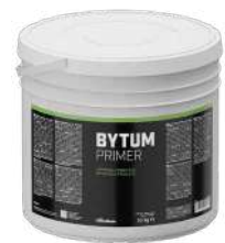
BYTUM PRIMER page 53